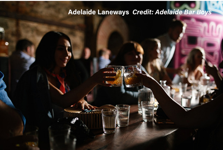
Adelaide Laneways