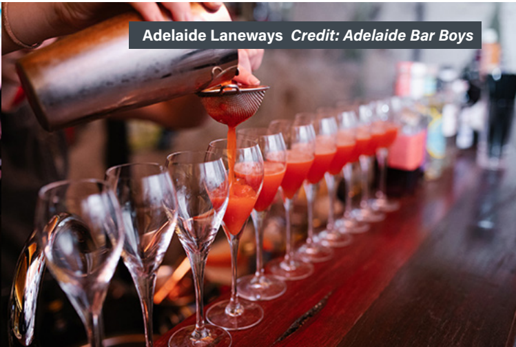
Adelaide Laneways