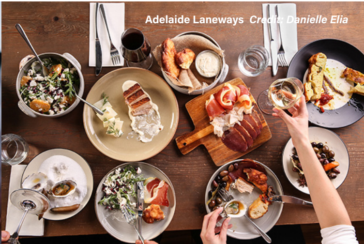
Adelaide Laneways