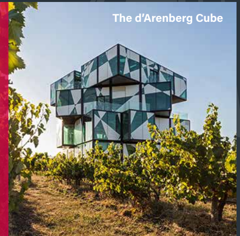
The d'Arenberg Cube

This diverse region provides iconic wineries with neighbouring beaches and unique water based activities.