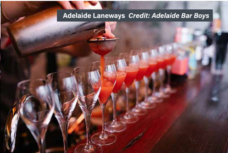
Adelaide Laneways