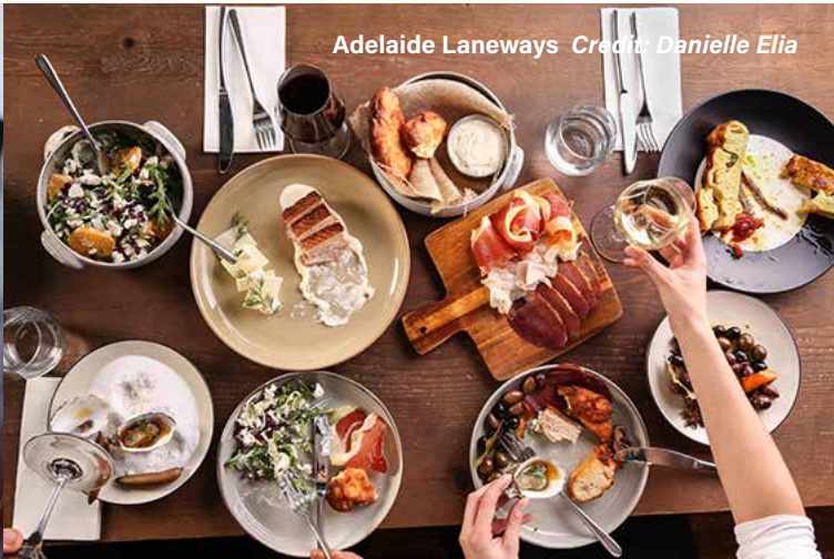
Adelaide Laneways