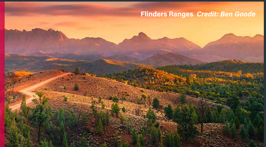
Flinders Ranges

There is so much to explore and it's all so close. Find the truly authentic Australian experience in Regional SA.