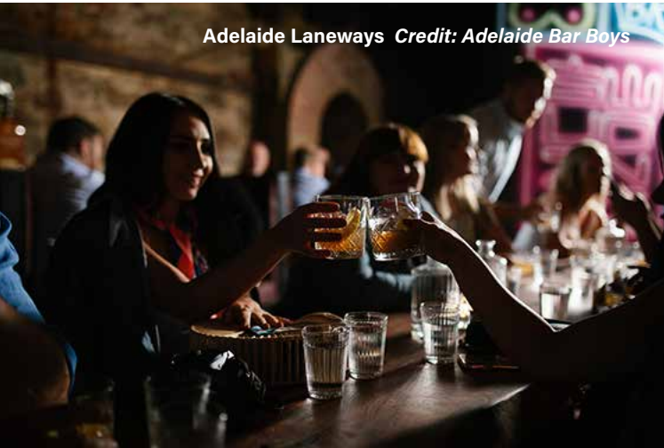
Adelaide Laneways