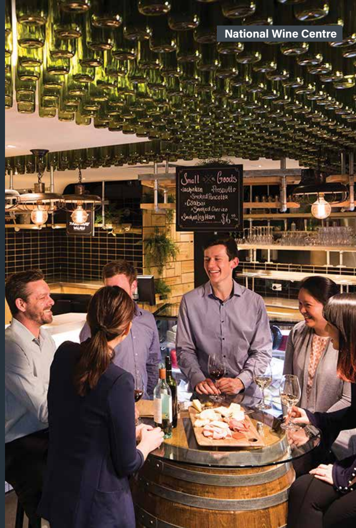
National Wine Centre

Adelaide's premium food and beverage offerings have extended into every laneway, cafe, bar and restaurant. Business event delegates will be spoiled for choice.