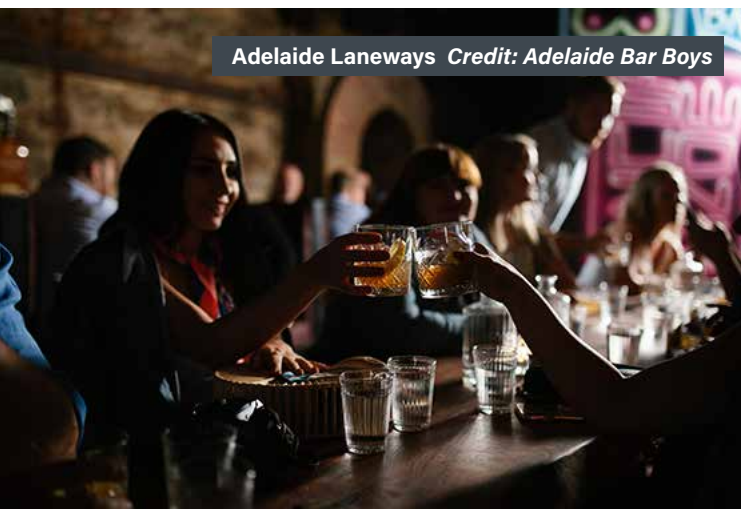
Adelaide Laneways