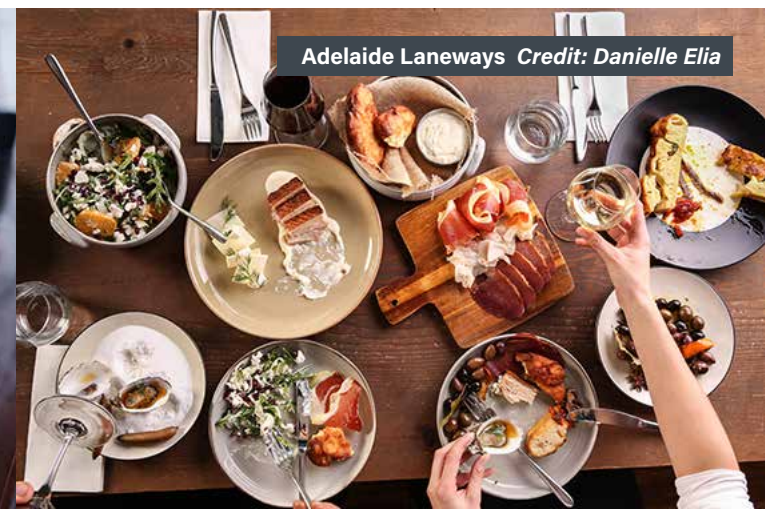
Adelaide Laneways