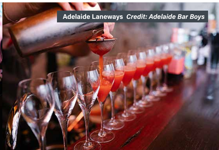
Adelaide Laneways